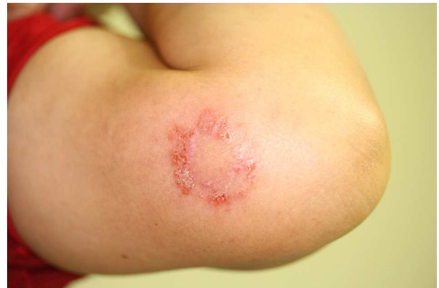
Fig. 1. A solitary, pruritic, 3.0 × 3.0-cm sized erythematous annular plaque with central clearing and vesicular border on the left upper arm

A 58-year-old female cattle keeper presented with a solitary, pruritic, 3.0 × 3.0-cm sized erythematous annular plaque with central clearing and a vesicular border on the left upper arm at one month after its emergence (Fig. 1). The results of KOH examination on the left upper arm lesion were negative. Therefore, we cultured and performed a biopsy for a definitive